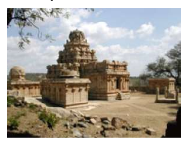
Fig. 10.1 Vijayalaya Choleswaram

Dravidian temple architecture is believed to have been started in the period of Pallavas and evolved in the period of Cholas.