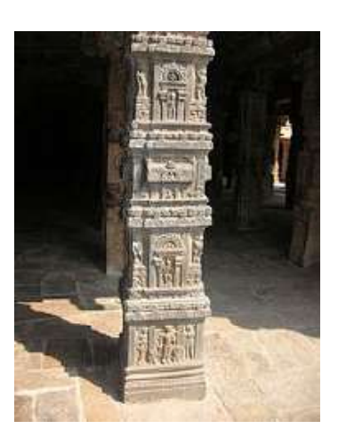
Fig. 10.6 Ornamented Pillar of Airavateswara Temple at Darasuram

Airavateswara temple at Darasuram is a classic example of Chola art and architecture. It has heavily adorned pillars (see Figure 10.6) and richly sculpted walls.