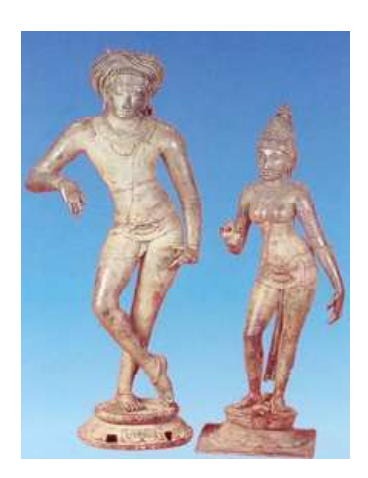
Fig. 10.7 Chola Bronze Icon. Siva and Parvathi c. 1200 AD