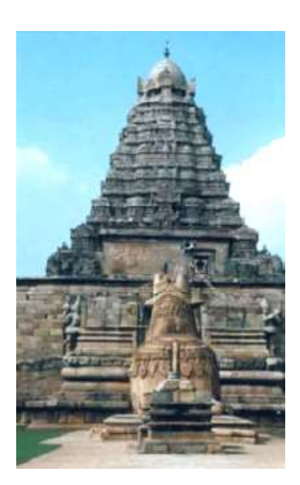
Fig. 10.4 Gangaikonda Cholapuram c. 1030 AD

Rajendra Chola founded the city of Gangaikondacholapuram to commemorate his victorious march to the Ganges. The temple of Gangaikonda Cholapuram built by Rajendra Chola was clearly meant to outshine its precursor in every way. Completed around 1030 AD, only two decades after the Temple at Thanjavur and in the similar style, the embellishment in its appearance shows that Chola Empire was in prosperous state under Rajendra rule.