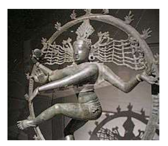
Fig. 10.9 Bronze Chola Statue of Nataraja at the Metropolitan Museum of Art, New York City

In the Figure 10.9, Siva is standing in Rishabaandhika pose with one leg crossed over to the other side. We can make out that the way his arm is raised, it is resting on something and tilting of his body suggests that he is leaning on an object. In this scene, Siva is leaning on Nandhi and his arm is resting on Nandhi's shoulders.