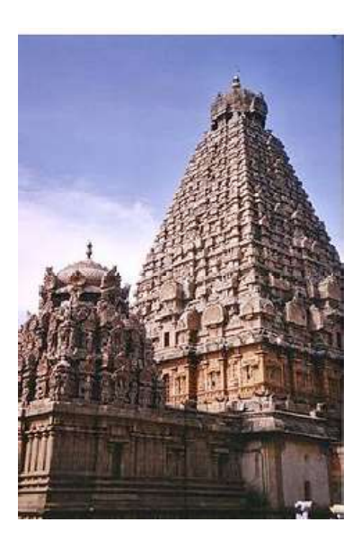
Fig. 10.2 Detail of the Main Gopura (Tower) of the Thanjavur Temple

Rajaraja Chola and his son Rajendra Chola I also contributed a lot to the art of temple building. Many small shrines, such as Tiruvalisvaram temple, were built during the early phase of this period. Designs of creepers and foliage have been used to decorate the cornice of the temple tower. Uttara Kailasa Temple at Thanjavur and Vaidyanatha Temple at Tirumalavadi have also been constructed using the same architectural structure.