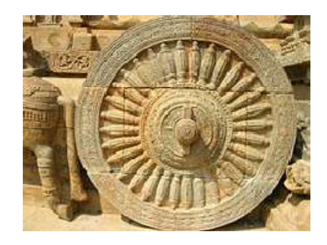
Fig. 10.5 Spoked Chariot Wheel, Airavateswarar Temple, Darasuram c.1200 AD

Kampaharesvara temple at Tribhuvanam built by Kulothunga Chola III is called the finest example of this period. The architecture style used in his temple is similar to that of the temples at Tanjore, Gangaikondacholapuram and Darasuram.