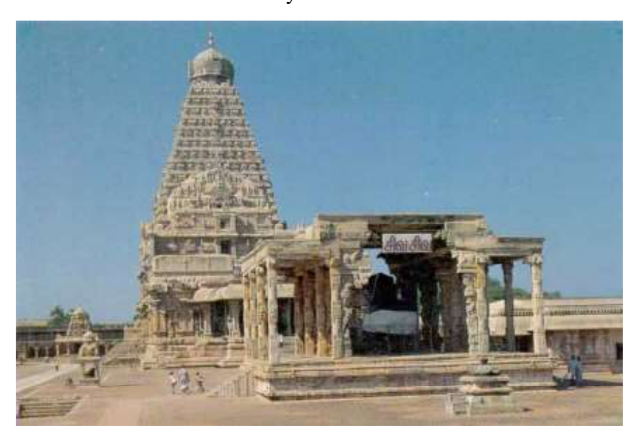
Fig. 10.3 Brihadeswara Temple, Tanjore

This temple was given the name of Rajarajesvaram by Rajaraja. He named the deity Shiva in Linga form, Peruvudaiyar. Thus, the temple is also called Peruvudaiyarkovil. In later period, Maratha as well as Nayaks rulers added various shrines and gopurams in the temple (see Figure 10.3). Later, the temple was renamed Brihadisvaram and the deity was called Brihadisvara.